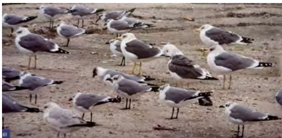
Five Lesser Black-backed Gulls with Laughing Gulls. Photo courtesy of Amar Ayyash, author of The Gull Guide . See the next page for details on a gull-focused field trip inspired by his talk on November 7 th (details on page 7.)